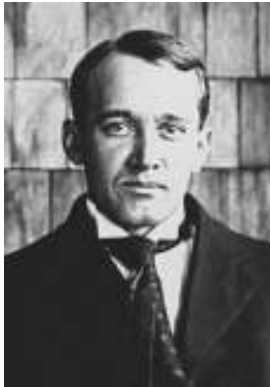
Figure 1.3 Vesto Melvin Slipher