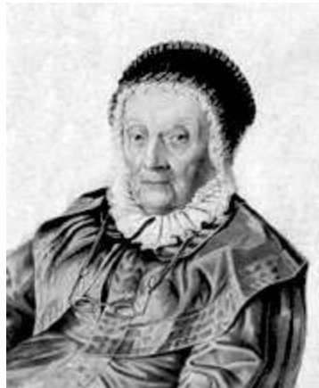
Figure 1.5 Caroline Herschel, sister of William (courtesy, NASA).